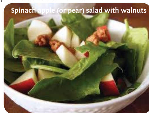
Spinach apple (or pear) salad with walnuts

Consider a heart health supplement like Hawthorne (which strengthens the heart muscle), Magnesium (which helps control blood pressure and heart rhythm),