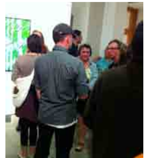
Members attending our AGM at Touchstones Museum on September 23rd