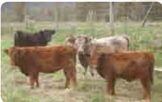
Vince's Dairy herd