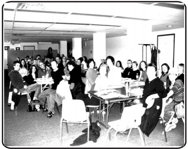
A Co-op Staff Meeting, Fall 2005